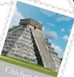
Chichen Itza Mexico