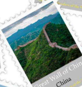
Great Wall of China China