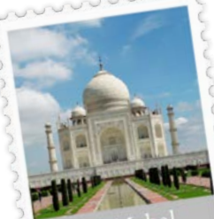
Taj Mahal India