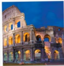
The Colosseum Italy