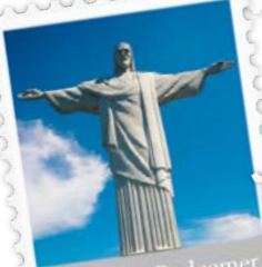
Christ the Redeemer Brazil