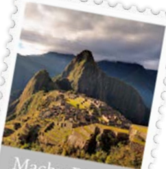
Machu Picchu Peru