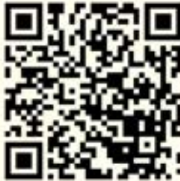
QR Cocktail Menu

Imbibing cocktails indoors between specified hours, typically at night.